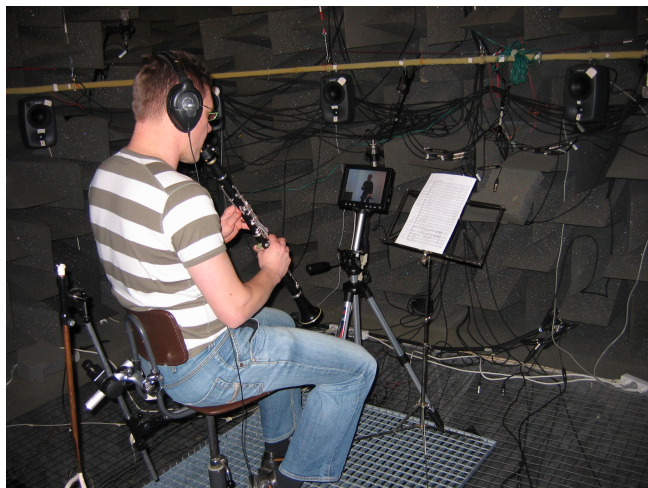
Figure 1: The recording configuration in an anechoic chamber. A musician followed the conductor video through the monitor and listened to the piano version of the whole score while playing his/her own part.

lected as another late Romantic composition. As the music is composed in the same period as Bruckner's symphony, they are both great examples of works which require large orchestras. However, the musical texture of Bruckner's music is quite conventional while Mahler is considerably more complex music. Bars 1-85 from the IV movement were recorded. The recorded excerpt has a duration of 2 min 12 sec.