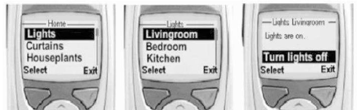
Figure 2: Example of a mobile phone UI

totypes and the evaluation phase-during which they gathered and analyzed data on user experience. After these six months, researchers came to a number of conclusions concerning couple's life assisted by the three UIs. For example, the couple liked the controlled automation in the apartment but had sometimes problems with the invisibility of automation. The couple was quite skeptical in the beginning about using the mobile phone UI at home but after a short period of time, mobile phone became their primary and most frequently UI. Examples of PC and mobile phone UIs are shown in Fig.1 and Fig.2